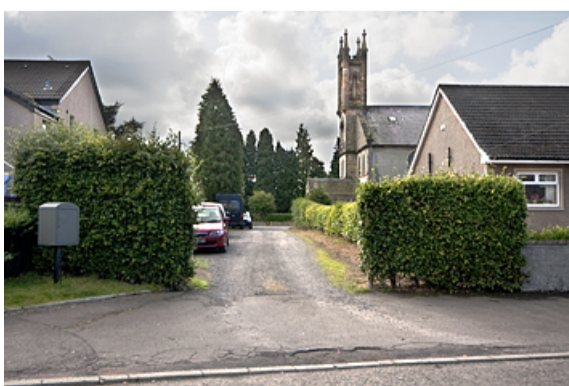
Above: The access from Kirk Road is easily missed, especially in the dark, as it looks like a hedge-lined private driveway.

For those unfamiliar with St Andrews Church, enter from Mount Stewart Street rather than Kirk Road. Beware of the narrow access.