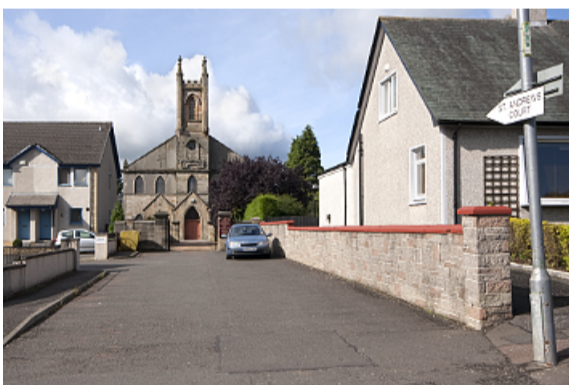
Above: It is probably easiest to access St Andrews Church grounds from Mount Stewart Street as the church is quite visible from this side.