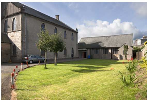
Above: Parking is limited within the church grounds. You may have to park in Mount Stewart Street.